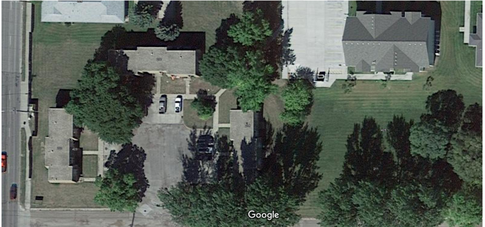
20 ft