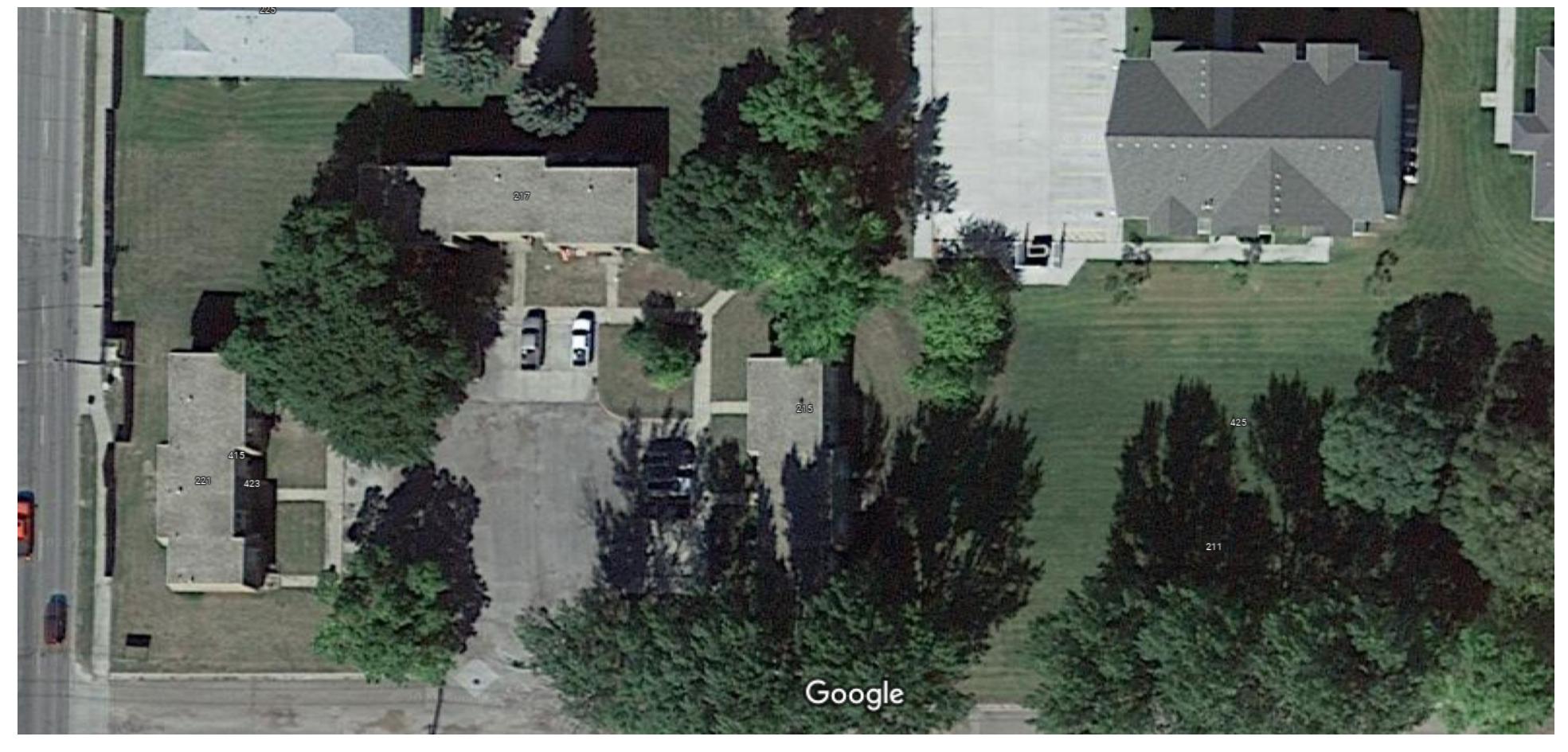
Imagery ©2023 Airbus, Maxar Technologies, Map data ©2023 Google 20 ft